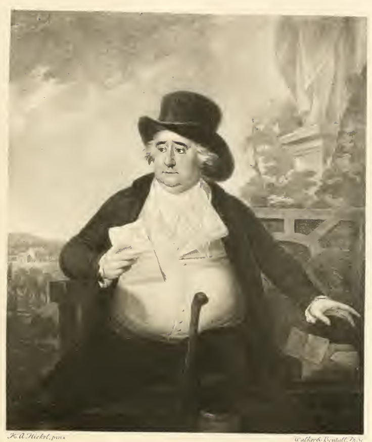
Walker & Boutall Physic